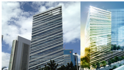
Net Lima Tower

The judging panel includes, but is not limited to, representatives from the World Bank Group's International Finance Corporation (IFC), the United Nations Environment Program (UNEP) and Business Council for Sustainable Development Singapore – Regional Network Partner of the World Business Council for Sustainable Development. ■