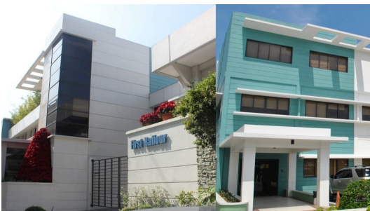
First Balfour Corporate Office

Leadership in Sustainability Design & Performance